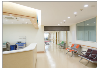
Health care facilities